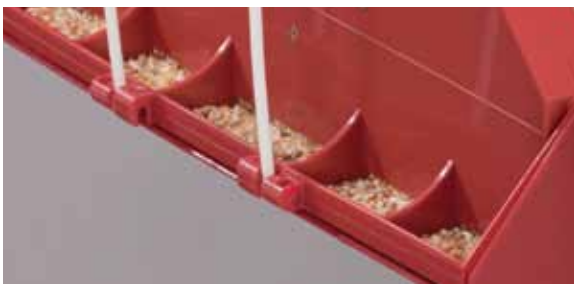
Trays feature feed savers to help prevent feed spillage.