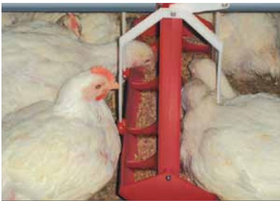
Older birds eat from a deeper, wider tray.