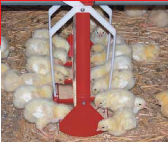
Day old birds eat from a low, narrow tray.