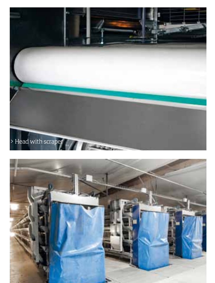
> Head covering curtain