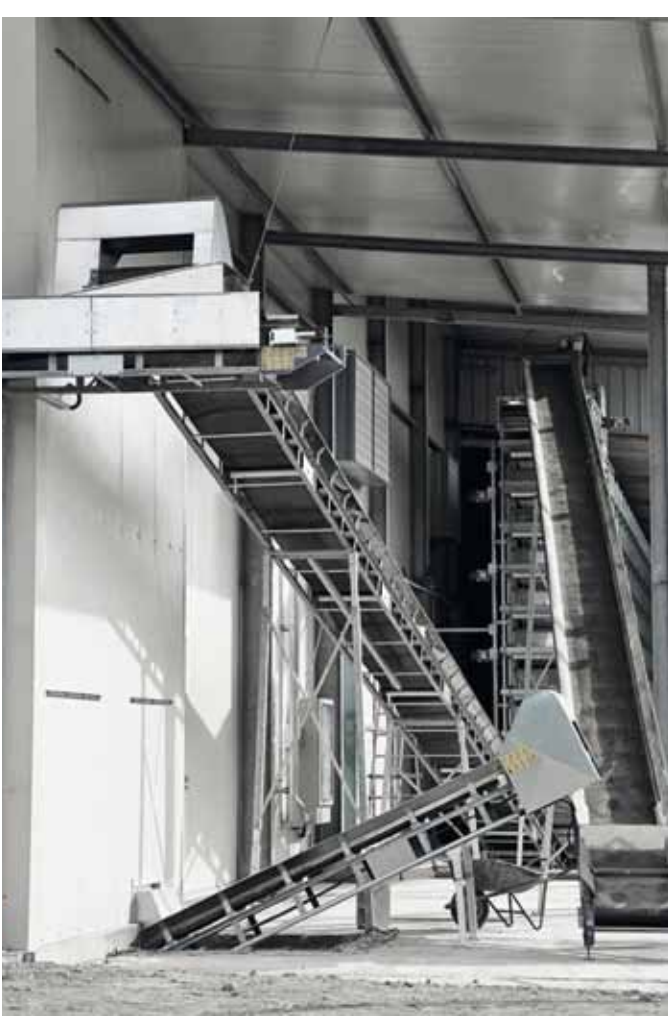
> Conveyor belts

Counter-heads with an auger transmission system for uniform tightening on both sides of the belt and ejection of manure and feathers caught between the belts.