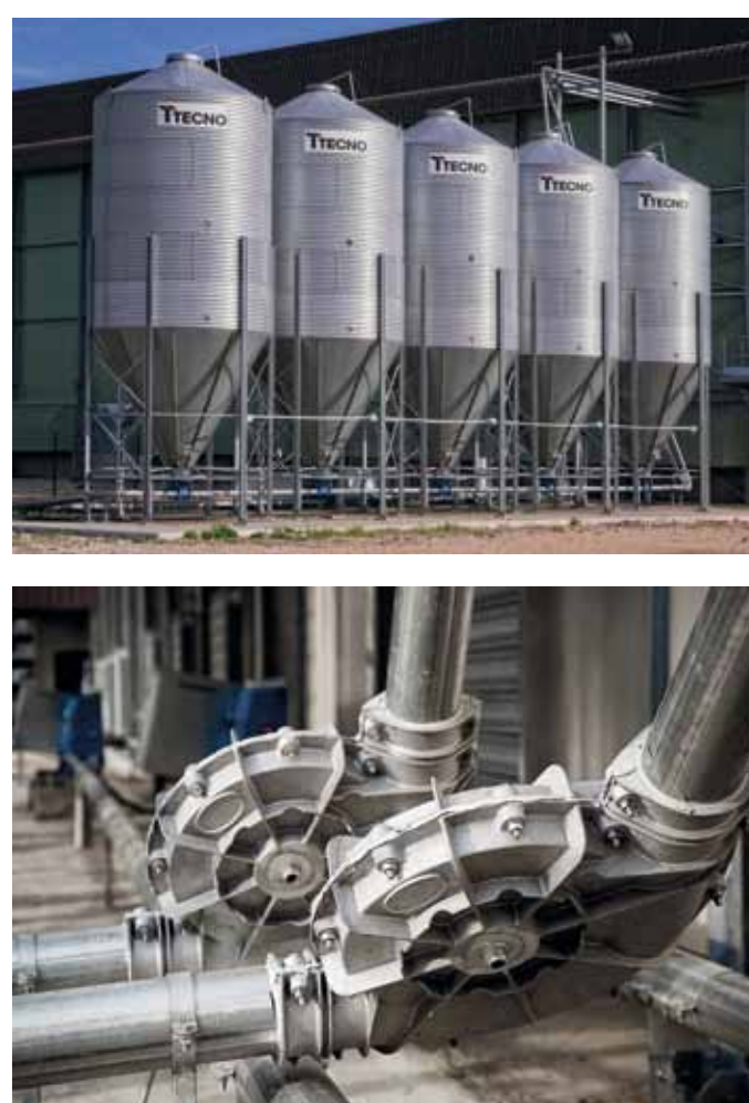
> 90° bends