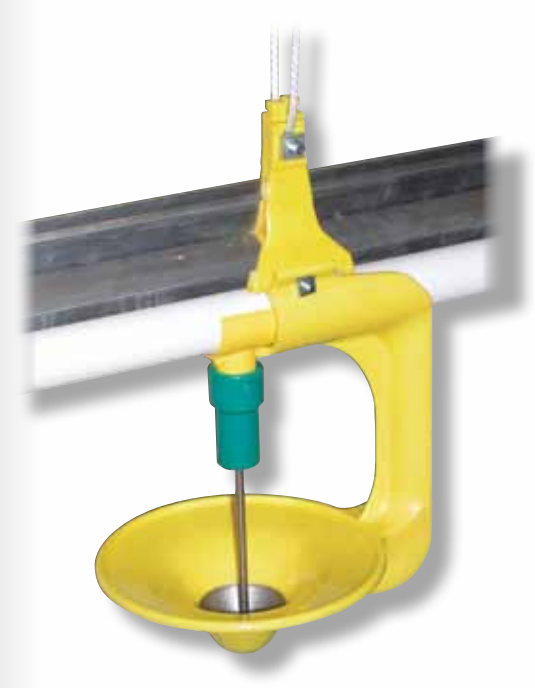
Available in both aluminum channel and conduit line support.

VAL-CO Turkey Watering can help you raise cleaner and healthier turkeys.